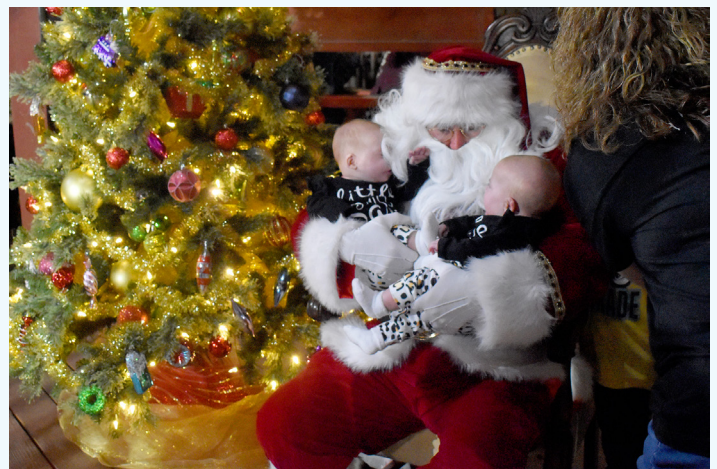
Working with GVFD and Dime Box Spirits for Santa at the Depot 2022

The Chamber & Visitors Center partnered with the Giddings Volunteer Fire Department and Dime Box Spirits to hold Santa at the Depot in December 2023. Santa arrived in spectacular fashion with sparkling lights and lots of sound, much to the delight of the children of all ages.