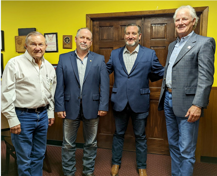
The Chamber helps Giddings leaders to arrange meetings, bringing in people from out of town and helping our local businesses.