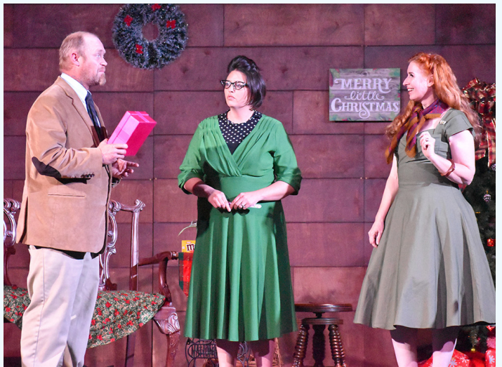
Staff created and volunteered for the Christmas theatrical production of the "The Christmas Gift Mixup." The play was promoted by the Chamber & Visitors Center. 181 people attended and 20 were from out of town.