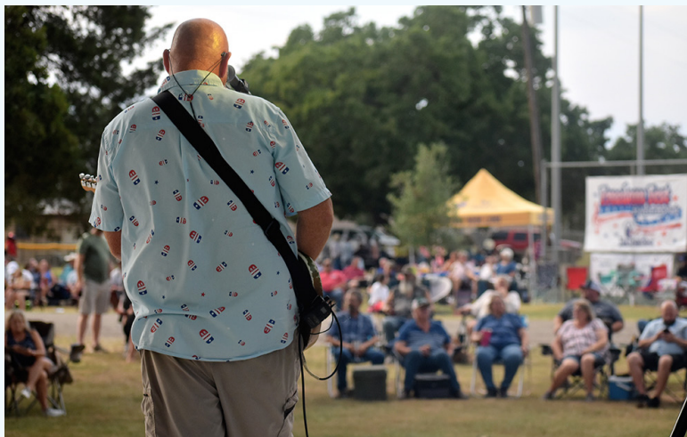
Freedom Fest was considered a homecoming for Giddings as well as a draw for visitors and tourists.