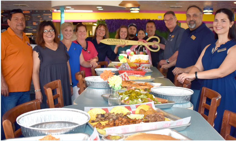
Encouraging and promoting our local businesses and restaurants