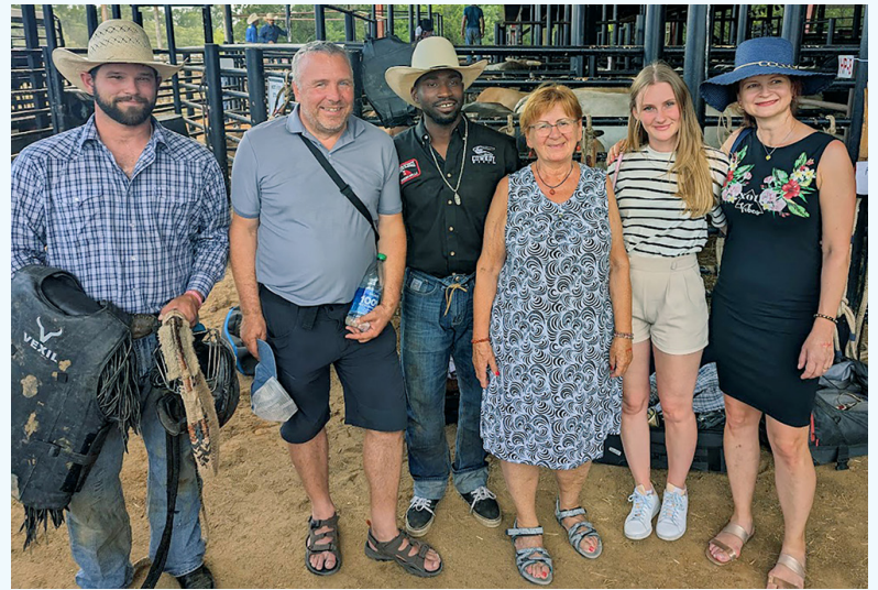
The Chamber & Visitors Center was instrumental in attracting visitors from Czechoslovakia to attend Fury on the Fourth so they could meet some real Texas cowboys!