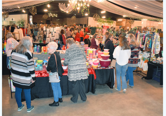
Hundreds of shoppers and vendors at the Sip & Shop Christmas in July Arts & Crafts show