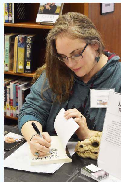
Chamber staff volunteers and serves on the board of the Texas Word Wrangler Book Festival as well as promotes the event. Staff photographs the event.

The Chamber assisted the creators of Fiesta Giddings with the creation of their event, helping them connect dots and find the resources they needed. The Chamber is promoting and advertising the event as well as continuing to help volunteers involved.