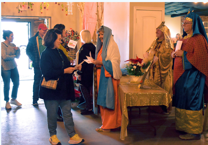
Working with other organizations to help them promote their events like the Navity Drive-Thru. The Cowboy Church volunteers greeted the crowds at the Sip & Shop Christmas Market