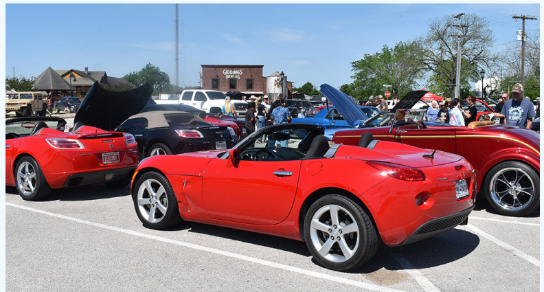
Assisting in the creation and promotion of Cars & Coffee. Staff was onsite at the event.

An estimated 100 cars were present with their drivers, making attendance somewhere around 500. This event was so popular that creators decided to make a bi-yearly gathering, with the next Cars & Coffee scheduled for October.