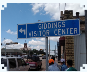
Visitor's Center Wayfinding Signs

The Chamber provides for Giddings hotels and B&B to have a THLA membership. Benefits that include advocacy, legal support & advice, marketing & complimentary listings on prominent tourism websites, education online & onsite, and access to resources.