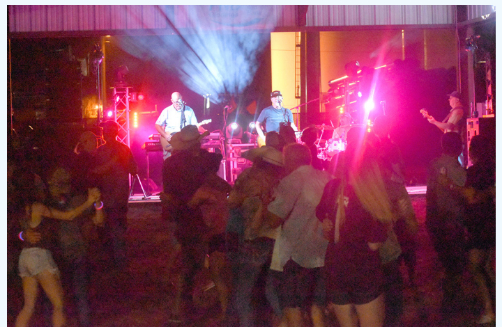
Delighted crowd dances to Texas Unlimited Band, July 2023 Freedom Fest

Attendees said more people than last year showed up to the event to listen to Texas Unlimited Band and the Lost Cause Band. A headcount made before TUB took the stage showed 500 people currently on the grounds.