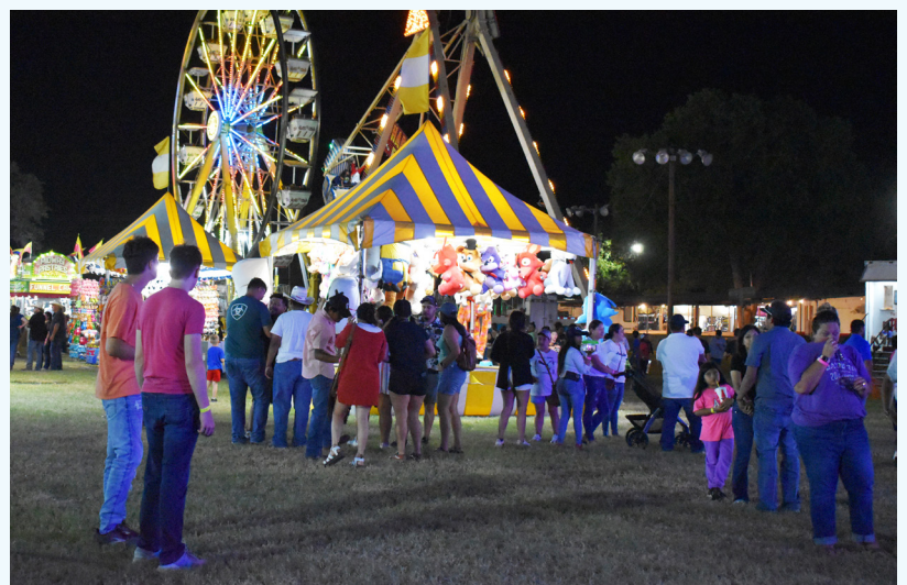
Staff volunteers at and serves on the board of the Lee County Fair as well as promotes the event. Staff serves as photographer at the Fair.